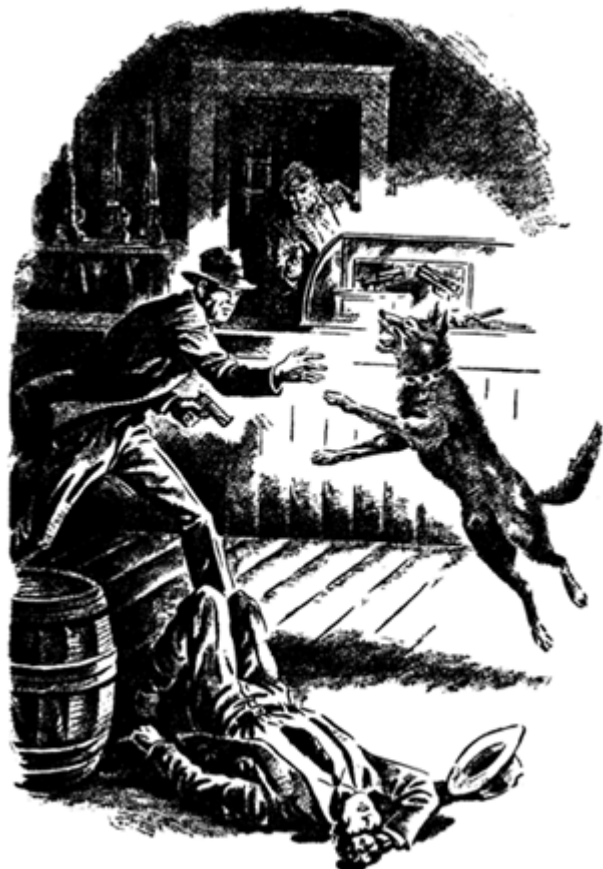
Fowler fought off the beast, and went for his gun as the dog leaped again (CHAPTER X)

The unsuspecting Drake back-watered toward Boyd. Boyd’s hairy, gorilla-like left arm closed over Drake’s windpipe, not over his chest. His right hand went to Drake’s waist and removed the knife. The thin, luckless Drake fought for a moment—until sharp steel sliced between his ribs.