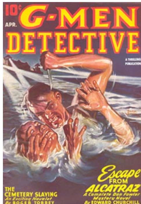
Cover painting by Rudolph Belarski

NEXT ISSUE'S THRILL-PACKED COMPLETE MYSTERY NOVEL