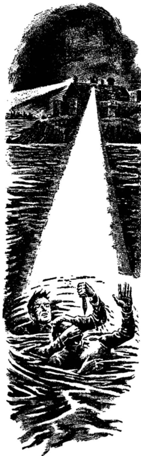
The luckless Drake fought until sharp steel sliced between his ribs (CHAPTER I)